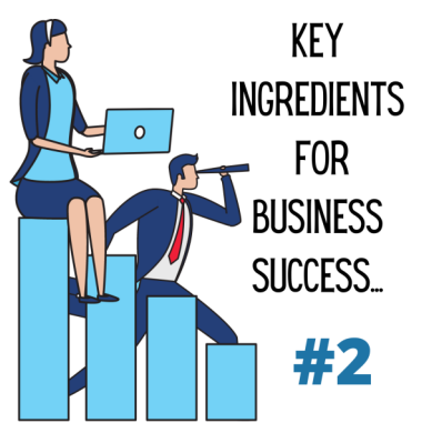
(Continues Next Page)

You need to understand your customers and tailor your content to their needs. Only those businesses that really know their customers deserve their business. You need to know what is important to them which could be price, convenience, location, or same day service. You also need to spell out your expertise and that might mean building content that focuses on your niche markets or specialist services. Don't forget to heavily promote your business' points of difference.