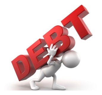
Continues Next Page