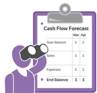
Cash Flow Forecast